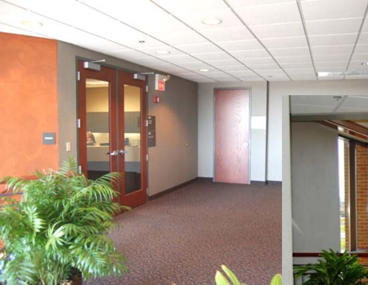
Building entrance and elevator, upper left, Woodbury map location, above, Suite 200 entrance below left, 2nd floor view and front stairway exit, below